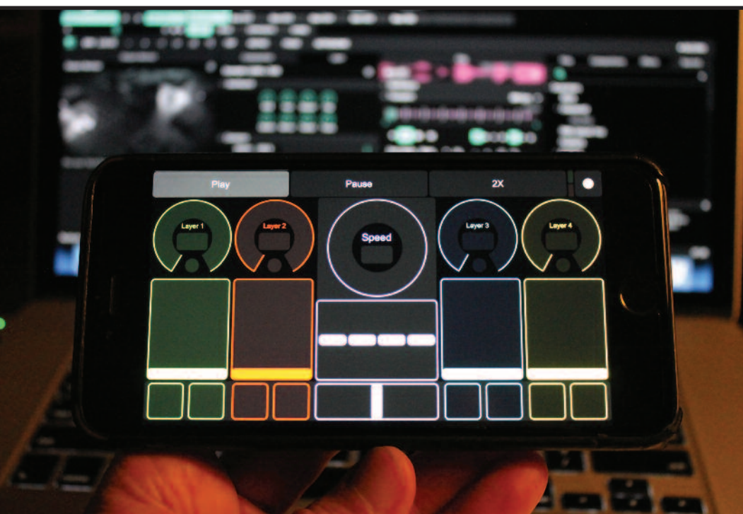
OSC is a powerful and flexible way of controlling a variety of systems, including media servers like Resolume Arena.

If Open Sound Control is really 21 years old—and it is—I have a lot of catching up to do. OSC was completely off of my radar for most of those years; it came to my attention after seeing a wireless remote controller at LDI about six or eight years ago. I was effectively able to ignore it, but now it is seemingly listed in most every media server spec you come across. My fear of missing out got the better of me, so I'm diving in.