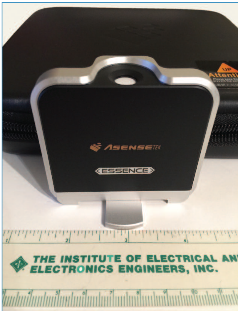
The Asensetek Lighting Passport light sensor can fit in the palm of your hand and connects through Bluetooth to an app on your smartphone or tablet.