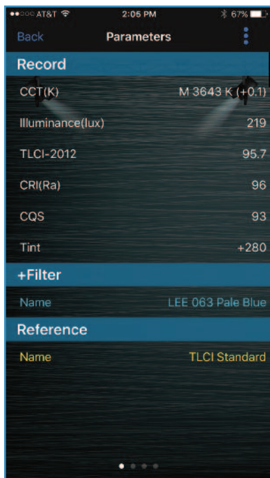
The Spectrum Genius Studio app for the Lighting Passport provides information about CCT, illuminance, TLCI, CRI, CQS, and more.